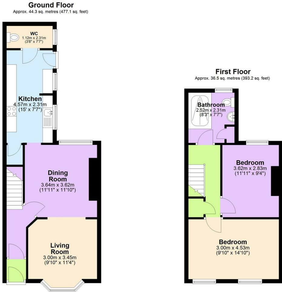
Total area: approx. 80.9 sq. metres (870.3 sq. feet) 17 Rutherford Terrace, Ferryhill