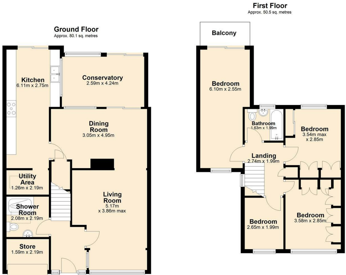
Total area: approx. 130.5 sq. metres 18 Elwick Avenue, Newton Aycliffe